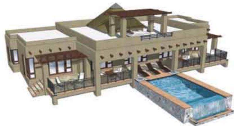
4 BEDROOM VILLA PLAN